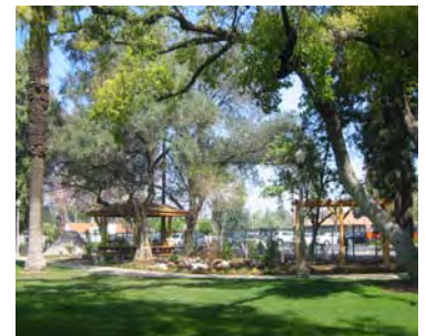
Japanese Garden at White Park