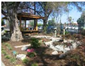
Tea House at White Park