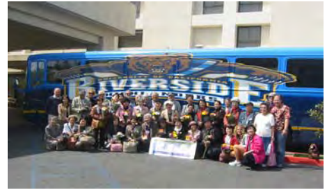
UCRX Brave Heart Bus Arrival at the Marriott