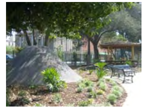
Japanese Garden at White Park