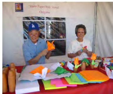
Origami Experts at Work