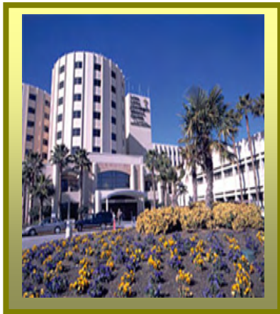
Loma Linda University Medical Center

Jiangmen Sister City Delegation successfully finished their two-day visit in Riverside. They left with our friendship and the learning experience back to China. We express our appreciation to all people who supported this delegation visit.